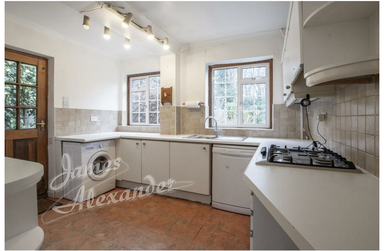
Kitchen 11'1" x 9'2" (3.4 x 2.8)